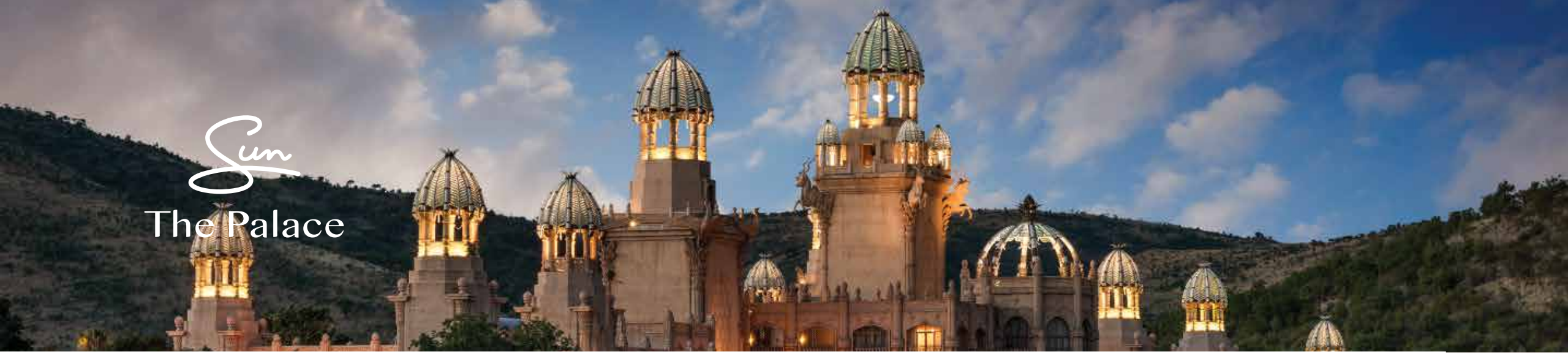
Sun The Palace