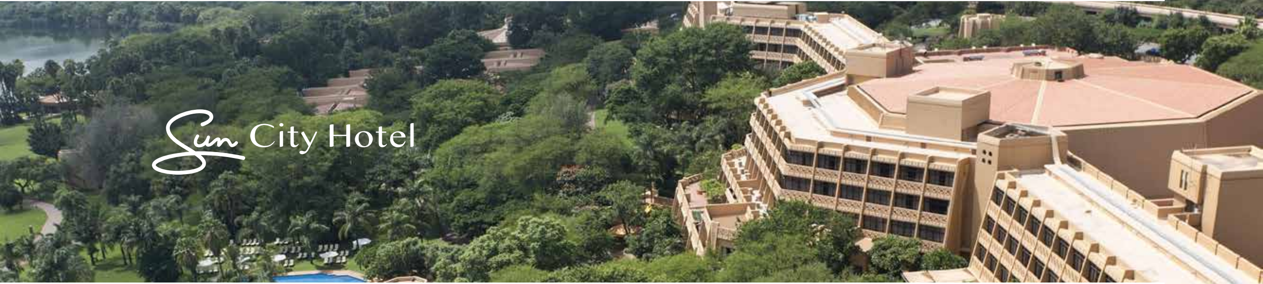
Sun City Hotel