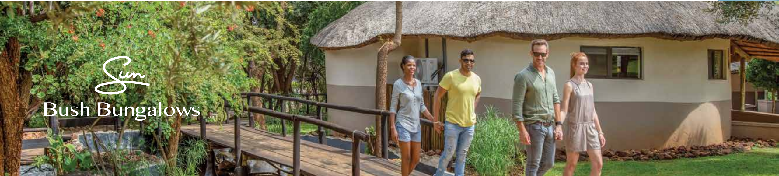
Sun Bush Bungalows